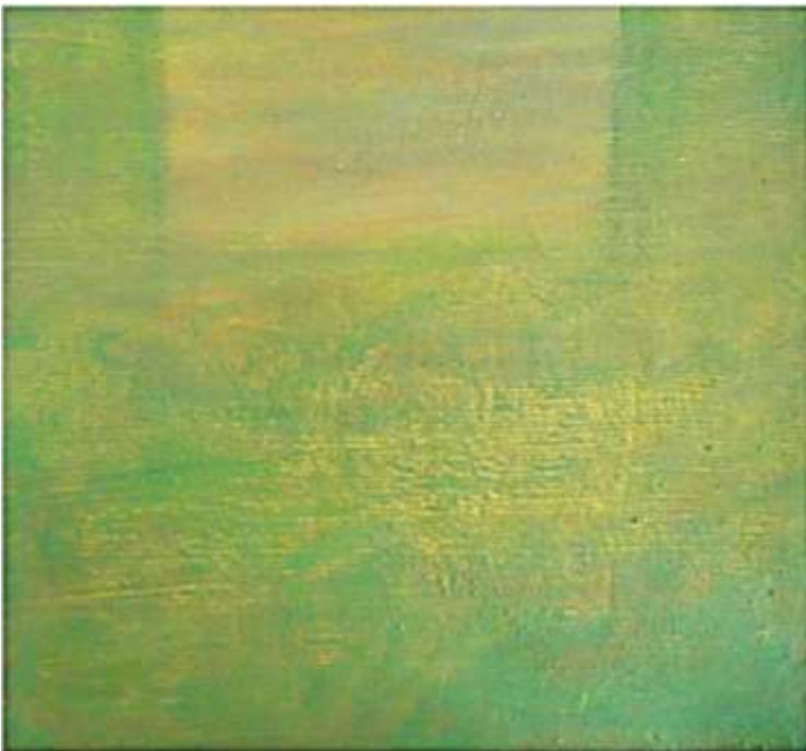
Name: Dipti Pandey Title: Untitled III & IV Medium: Mixed media on paper Size: 12 x 12 Inches Price: INR 18,000 Each