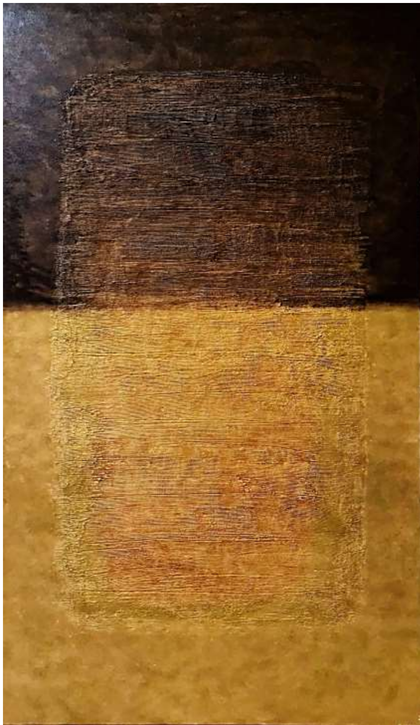
Name: Dipti Pandey Title: Paused Medium: Mixed media on canvas Size: 72 x 40 Inches Price: INR 3,75,000