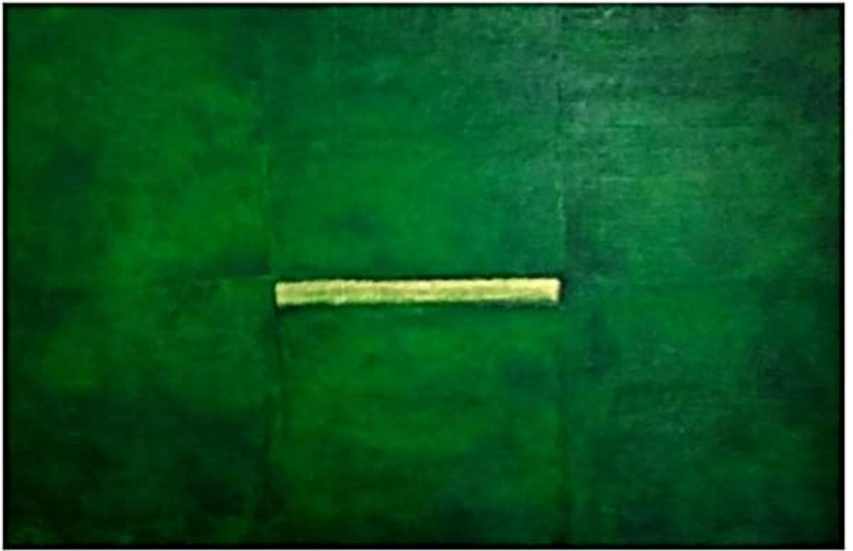
Name: Dipti Pandey Title: Untitled Medium: Mixed media on canvas Size: 48 x 60 Inches Price: INR 3,60,000