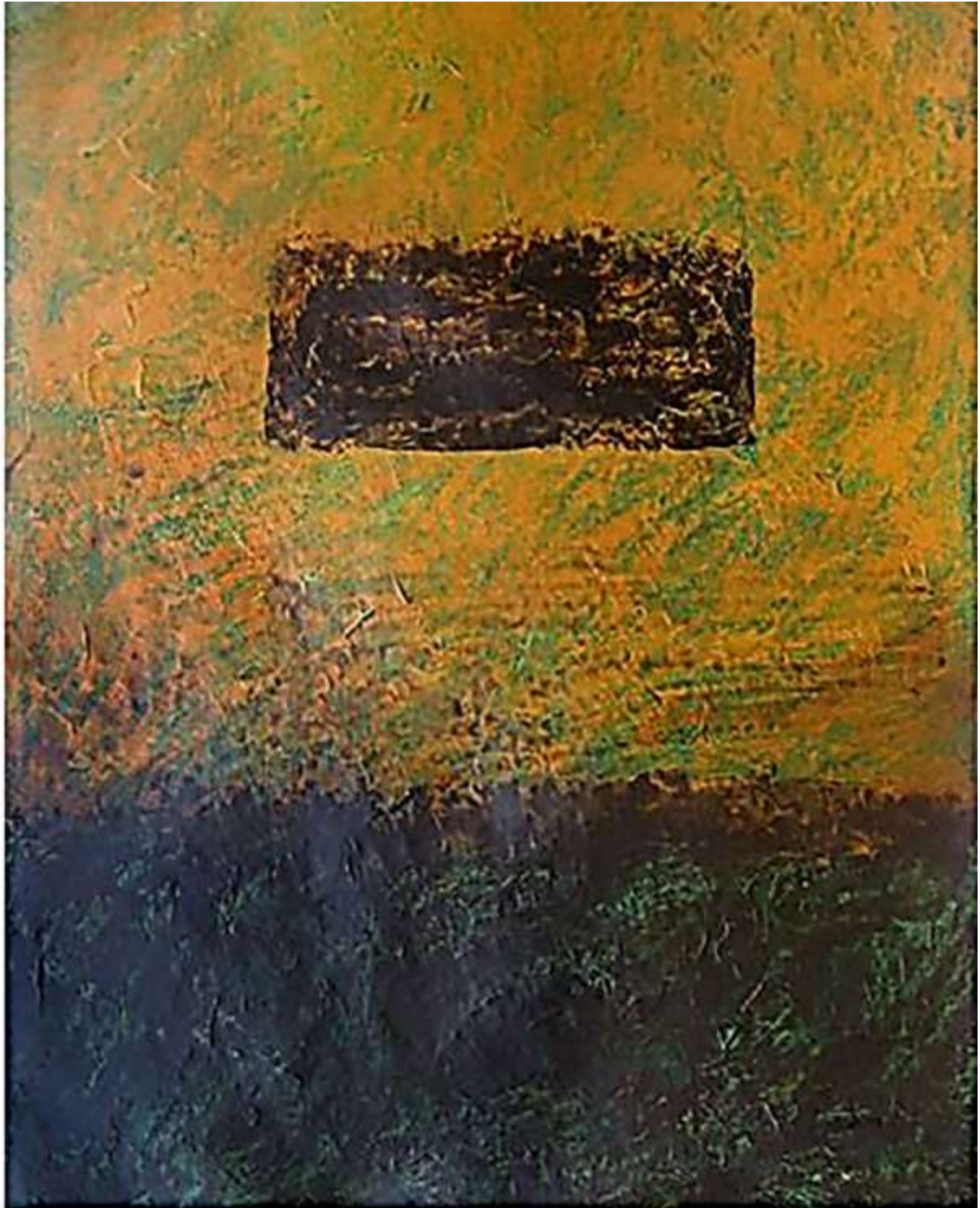
Name: Dipti Pandey Title: Untitled Medium: Mixed media on paper Size: 30 x 22 Inches Price: INR 30,000