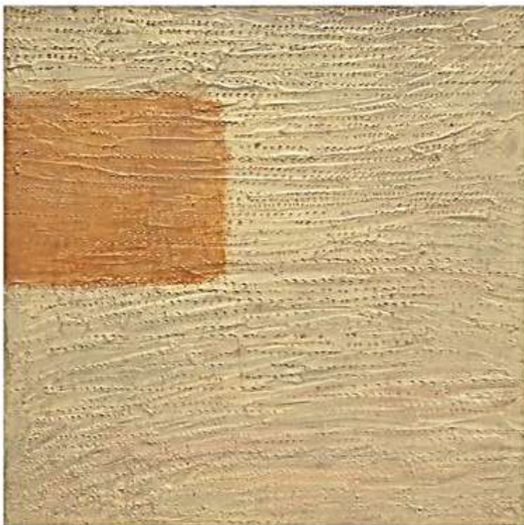
Name: Dipti Pandey Title: Untitled I & II Medium: Mixed media on canvas Size: 36 x 36 Inches Each Price: INR 2,00,000 Each