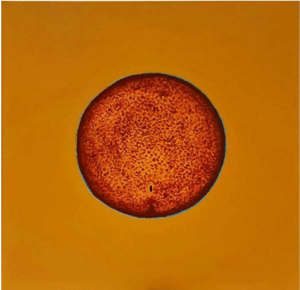
Beej I , 24'' x 24 '' , Acrylic on Canvas , 2020

The artist's lineage comes from the abstraction that looks at nature intensely, by focusing on germination and life with a childlike curiosity- to look at a sesame seed that grows in her balcony window that overlooks the maze of urban architecture- the ever-expanding skyline that never ceases to grow.