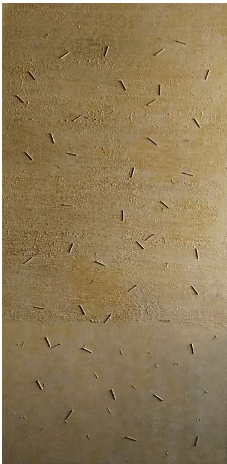
Name: Dipti Pandey Title: Futile Connections Medium: Mixed media on canvas Size: 78 x 40 Inches Price: INR 4,00,000