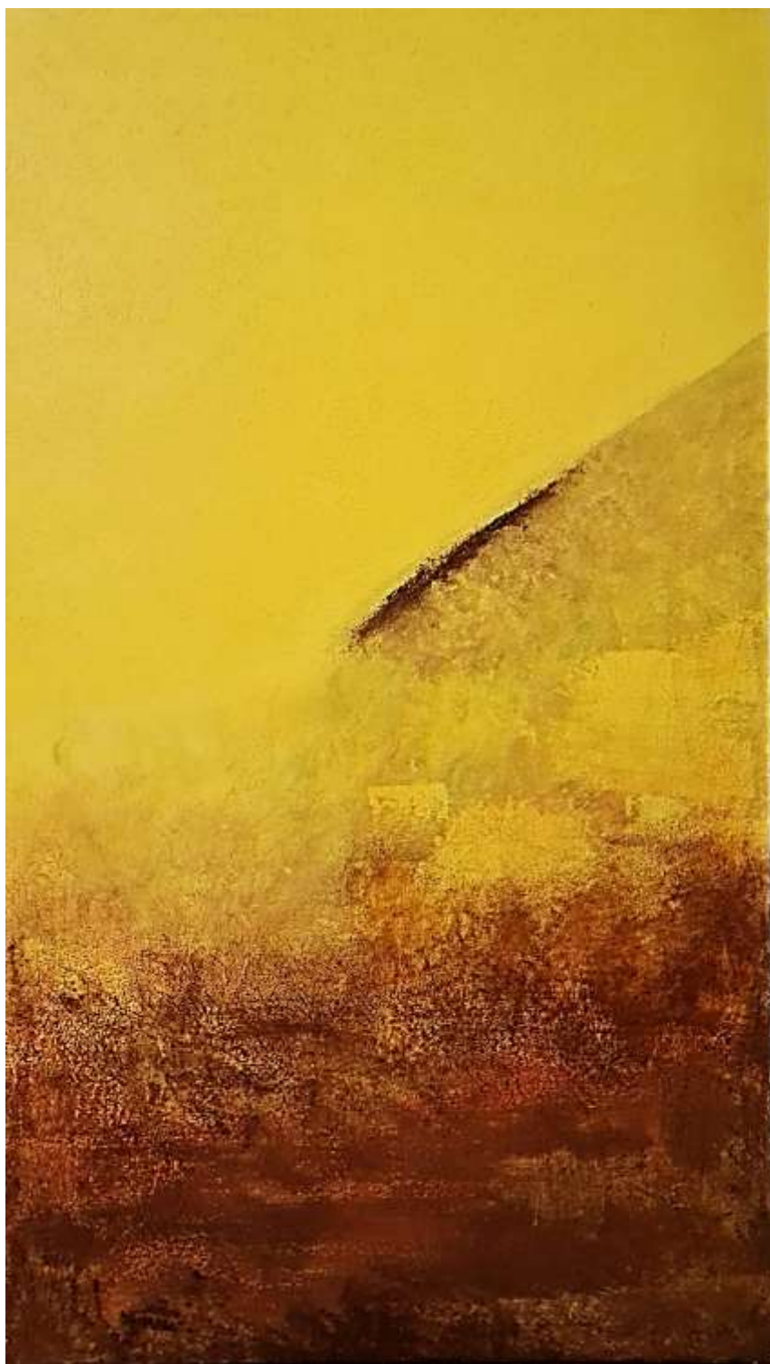
Name: Dipti Pandey Title: Sunshine Medium: Mixed media on canvas Size: 72 x 40 Inches Price: INR 3,75,000