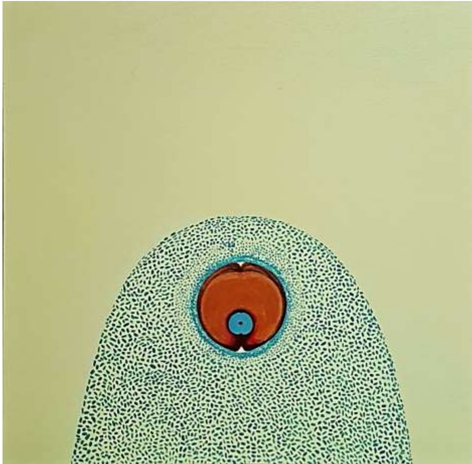
Beej III , 24'' x 24 '' , Acrylic on Canvas , 2020