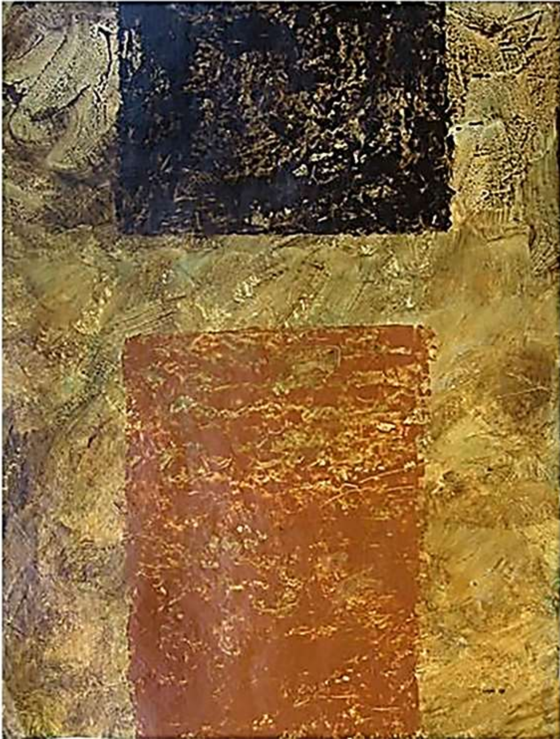
Name: Dipti Pandey Title: Untitled Medium: Mixed media on paper Size: 30 x 22 Inches Price: INR 30,000