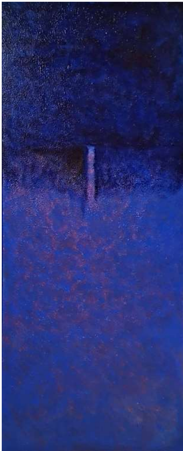
Name: Dipti Pandey Title: Ocean Medium: Mixed media on canvas Size: 72 x 36 Inches Price: INR 3,25,000