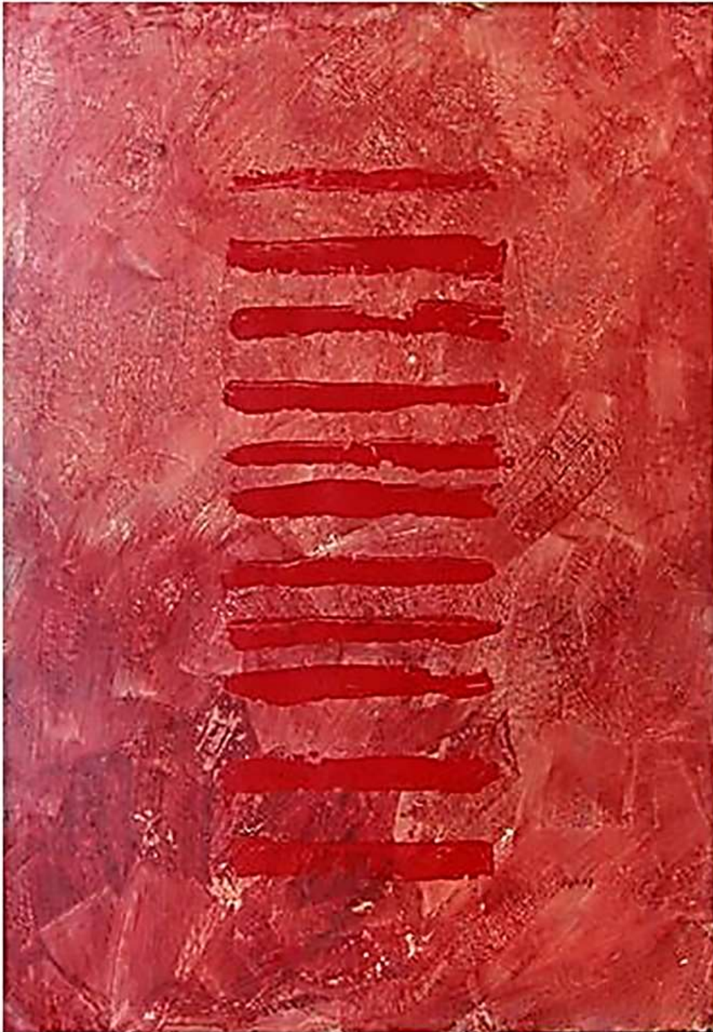
Name: Dipti Pandey Title: Untitled Medium: Mixed media on paper Size: 30 x 22 Inches Price: INR 30,000