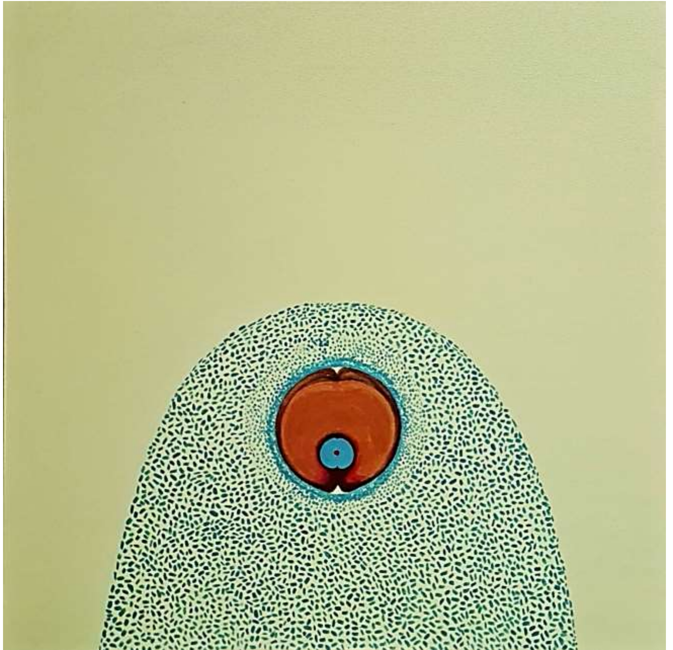
Name: Dipti Pandey Title: Beej III Medium: Acrylic on canvas Size: 24 x 24 Inches Price: INR 85,000