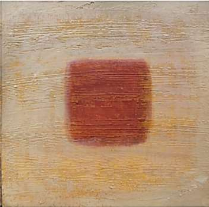
Name: Dipti Pandey Title: Untitled I & II Medium: Mixed media on paper Size: 12 x 12 Inches Price: INR 18,000 Each